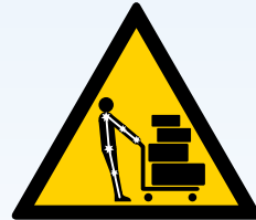
Pulling & Pushing