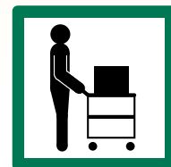
▪ Use a cart