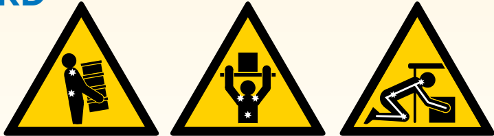
Lifting & Lowering