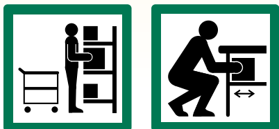
▪ Don't store things on the floor