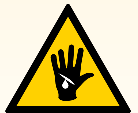
Absorbing or puncturing in the skin